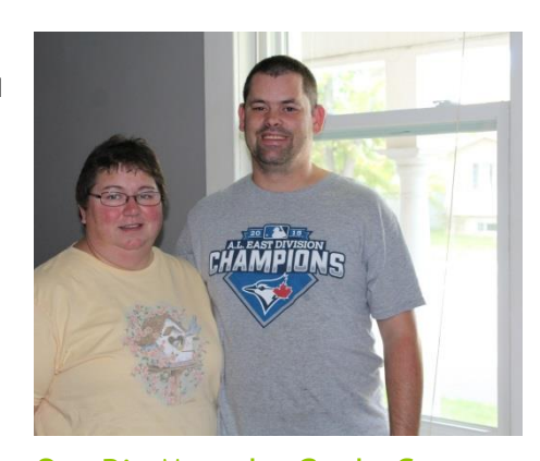
Our Big Move by Gayle Cayen